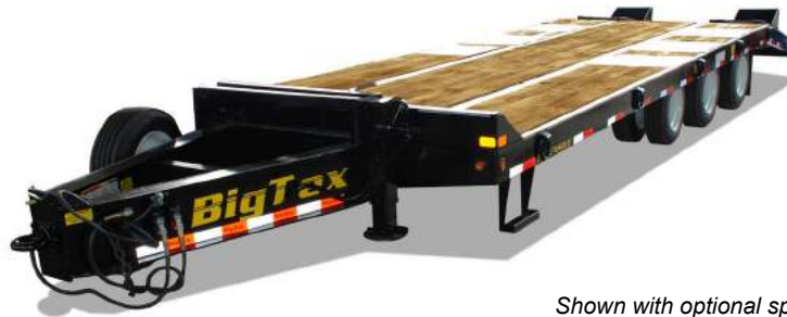
Shown with optional spare tire & wheel and dual 2 speed landing gear